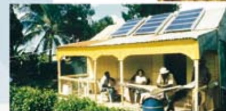
School equipment and huts with solar panels. Vanuatu