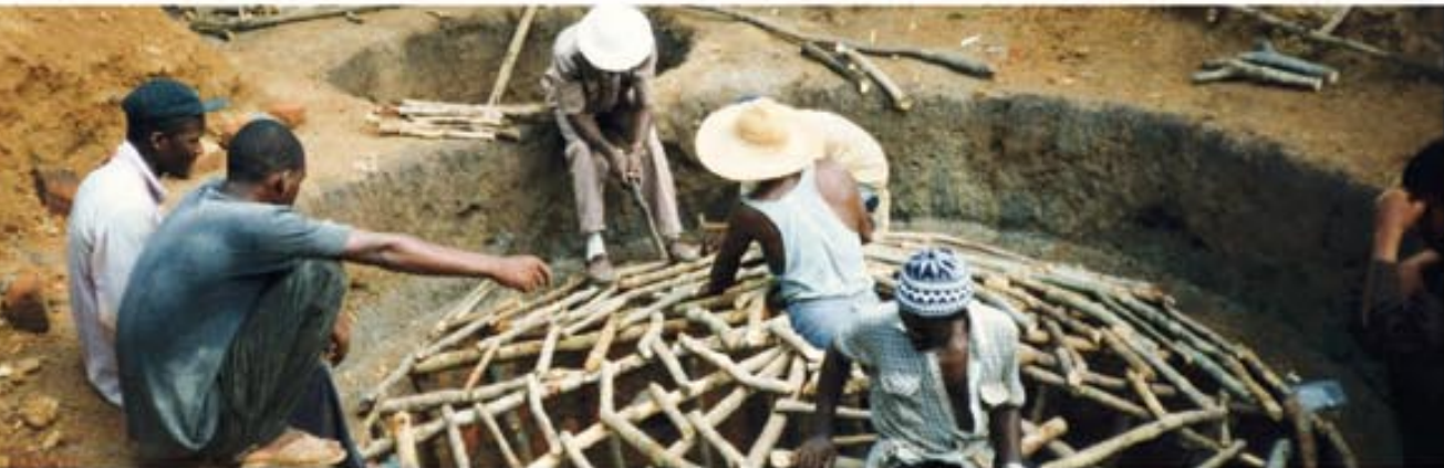
Construction of a digestion tank for retrieving biogas, in view of lighting a village, Guinea

These two Programs are divided into six Projects: